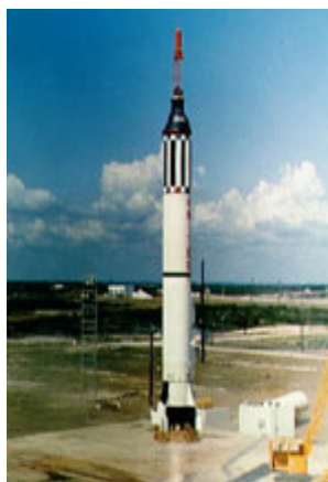
Alan Shepard lifts-off on the first manned US space flight, May 5, 1961.

LOC IV $95 4" dia. x 48" tall 29mm mount 1/16" G-10 fins Glassed body tube Solid red finish, ready for trim Acme 1/4" conformal launch lugs Aero Pac screw on motor retainer Only has 1 flight on it If interested, contact Randy Brust at rcbrustee@aol.com