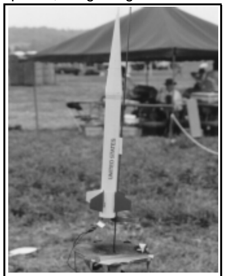
Mark Beever's Nike-Smoke sport scale entry

Our first flight goes to 234 meters on a C10 motor. Amazingly, despite a tangled chute, the egg holds together. But 234 meters just won't get it done, so we prep a smaller, lighter model. Again using a C10 for power, we get a great boost