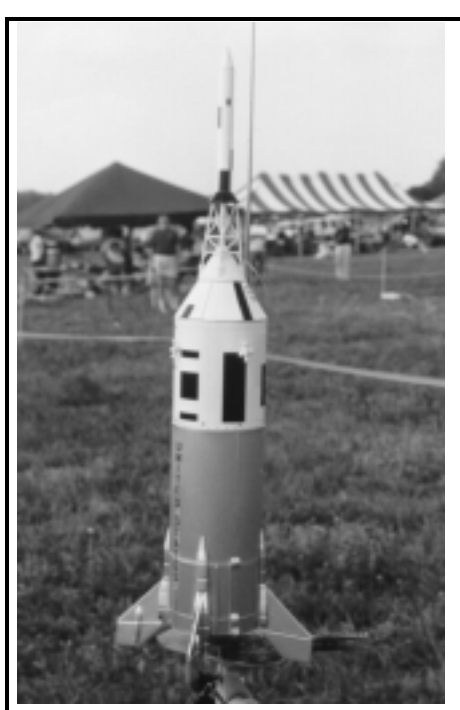
A nicely detailed Little Joe II

The CD can now be seen running between the tracking stations offering his thoughts on the sinking of the Titanic and his theory on how the atom bomb was a fake. He is also heard on the range radio frequency, telling those persons who persist on using channel 5, in defiance of regulations, that "if you don't stop using this frequency and get off of it, I will have some very special range duty for you tomorrow!" I believe him. On top of this, a falling rocket whacks his car for the second straight day.